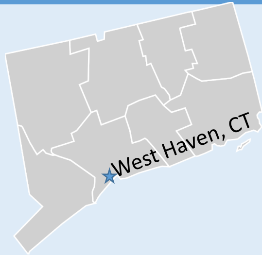
Race/Ethnic Makeup West Haven, CT