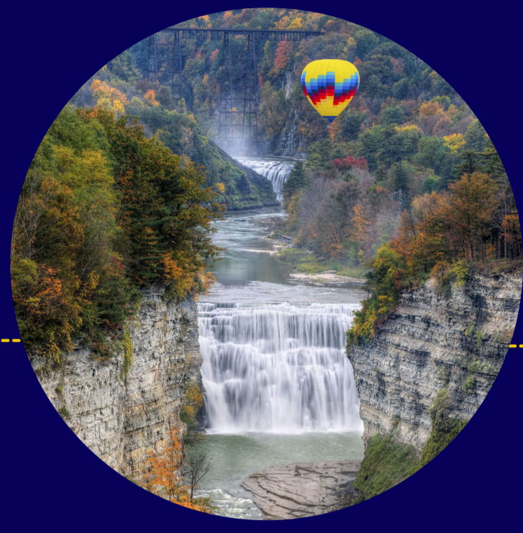
Referral center for all children in 17 county Finger Lakes Region