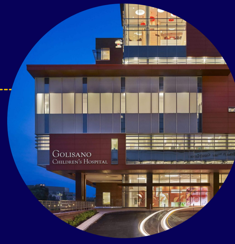
Academic Non-Profit Acute Care Children's Hospital