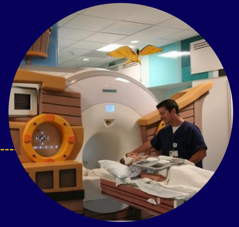
>85,000 families >2,000 ICU admissions 21,000 pediatric surgeries Annually