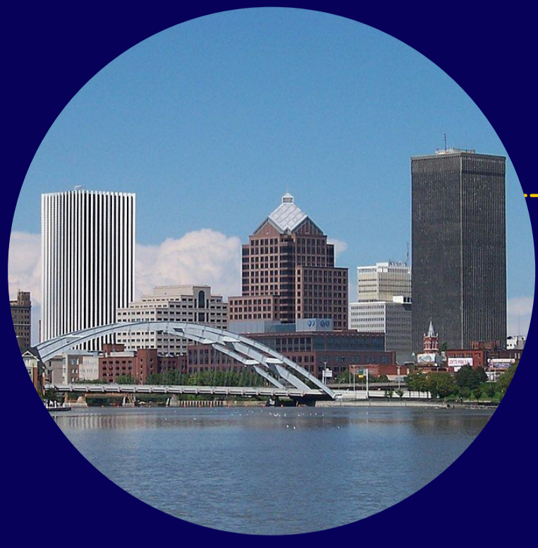
Located in Rochester, NY